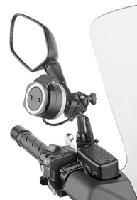
Supplied clamp mount