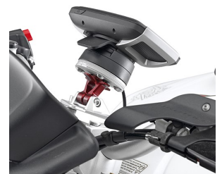
Combined with S901A