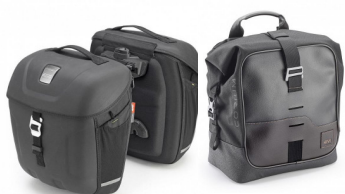
Metro-T & Corium Ranges Café Racer