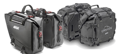
Canyon Range Adventure