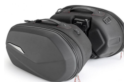
Sport-T Range Sport / Touring