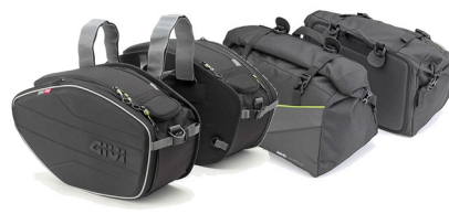
Easy-T Range Urban / Touring